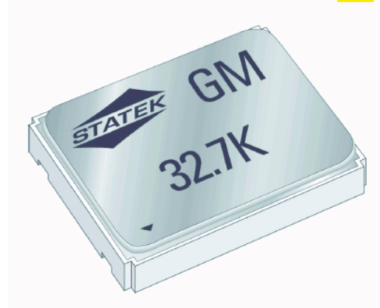
Outline (mm) -SM1 = Gold Plated