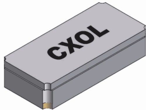
Outline (mm) SM1 = Gold Plated (RoHS)