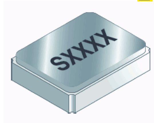
Outline (mm) SM1 = Gold Plated (RoHS)