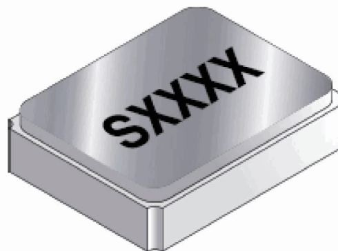
Outline (mm) A-SM1 = Gold Plated (RoHS), 5000G